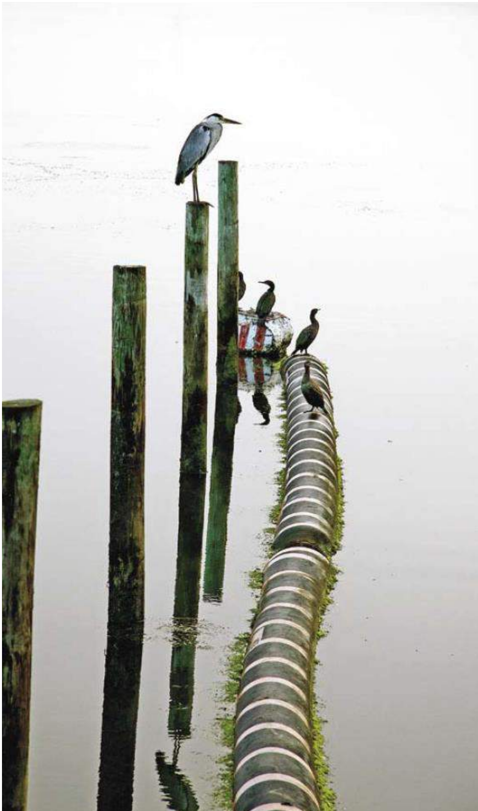
Grey heron on a grey morning