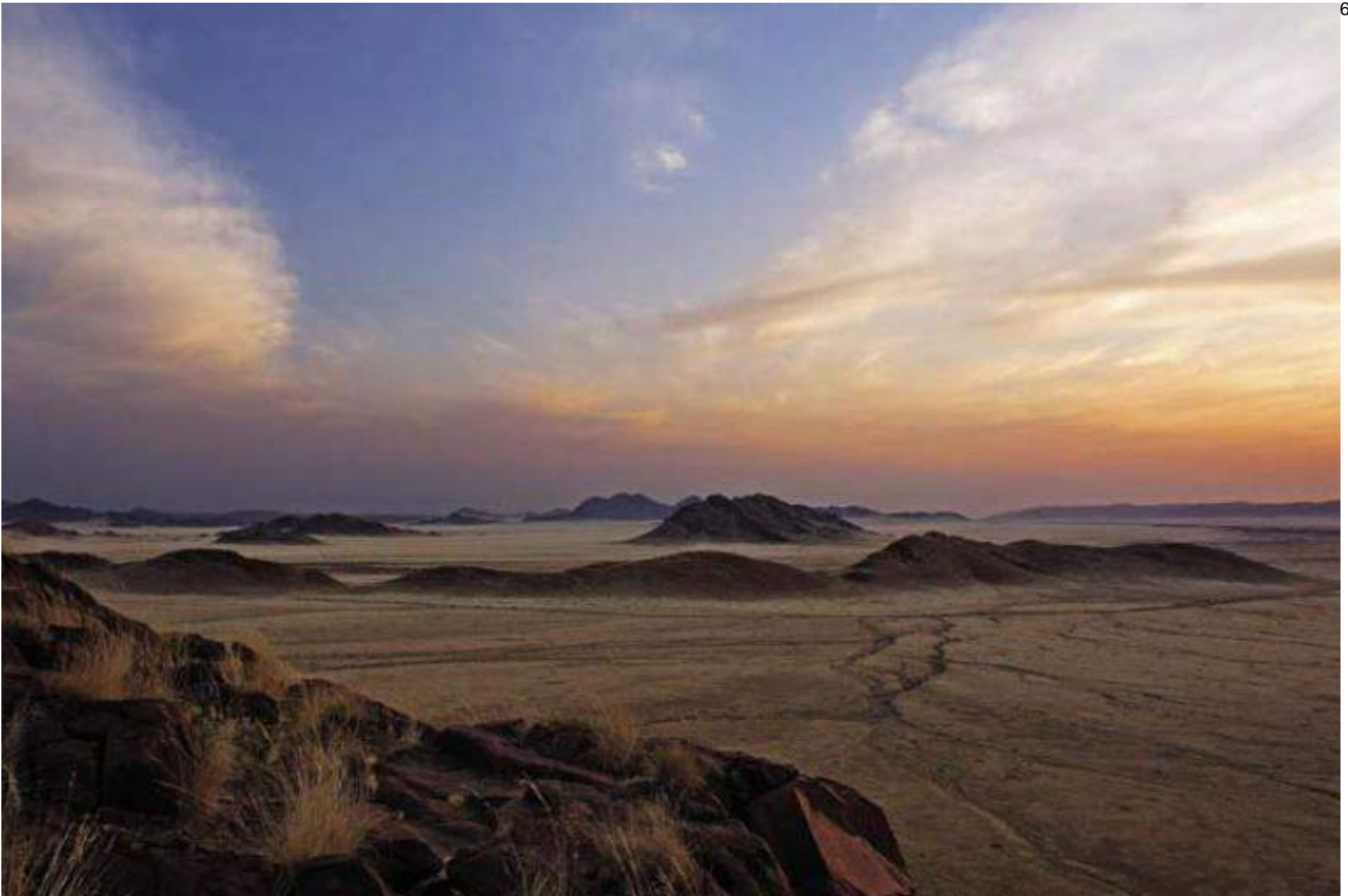
Sunset view, Sossusvlei, Namibia.