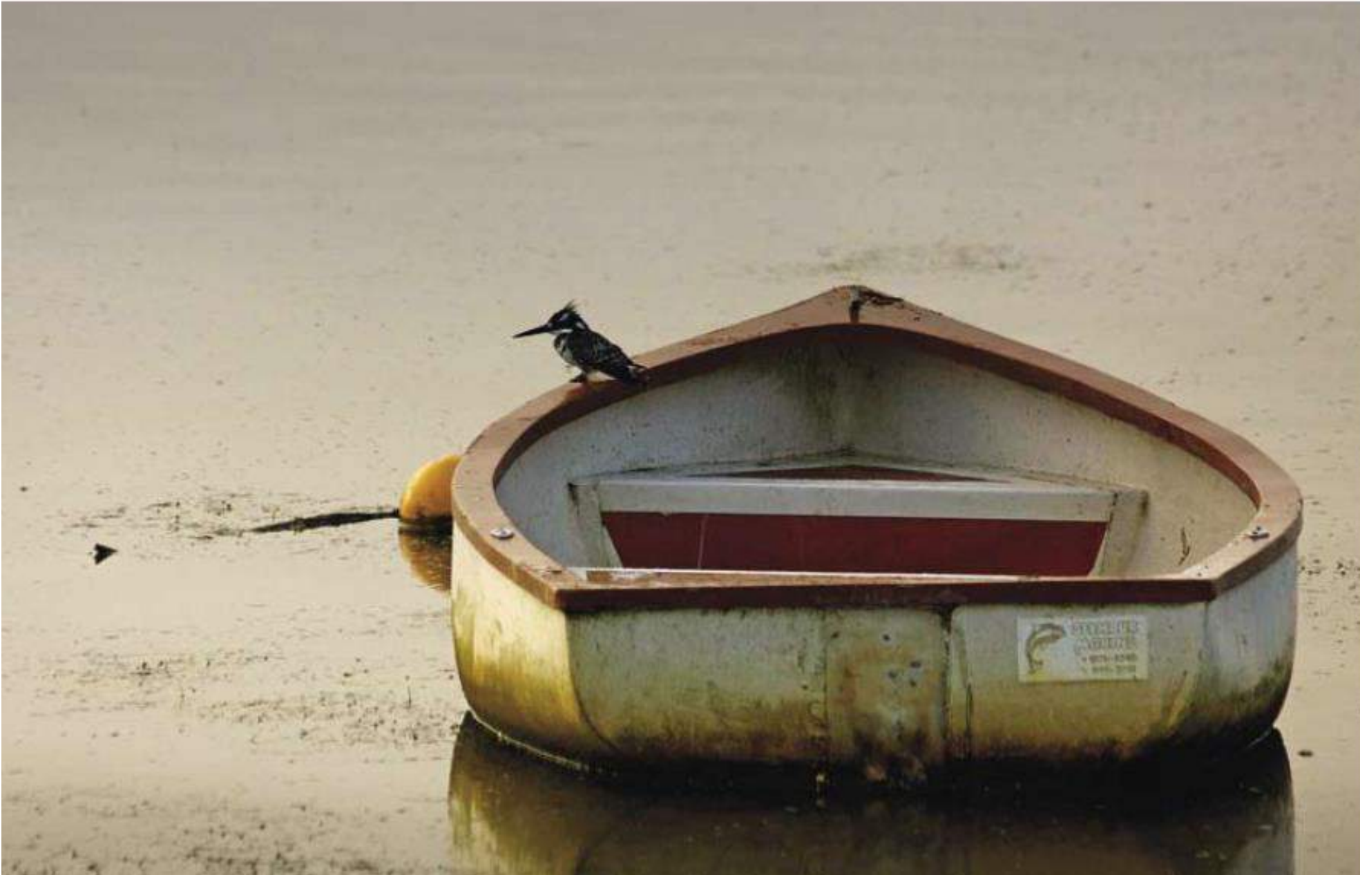
Bird on boat at Leisure Isle, Knysna.