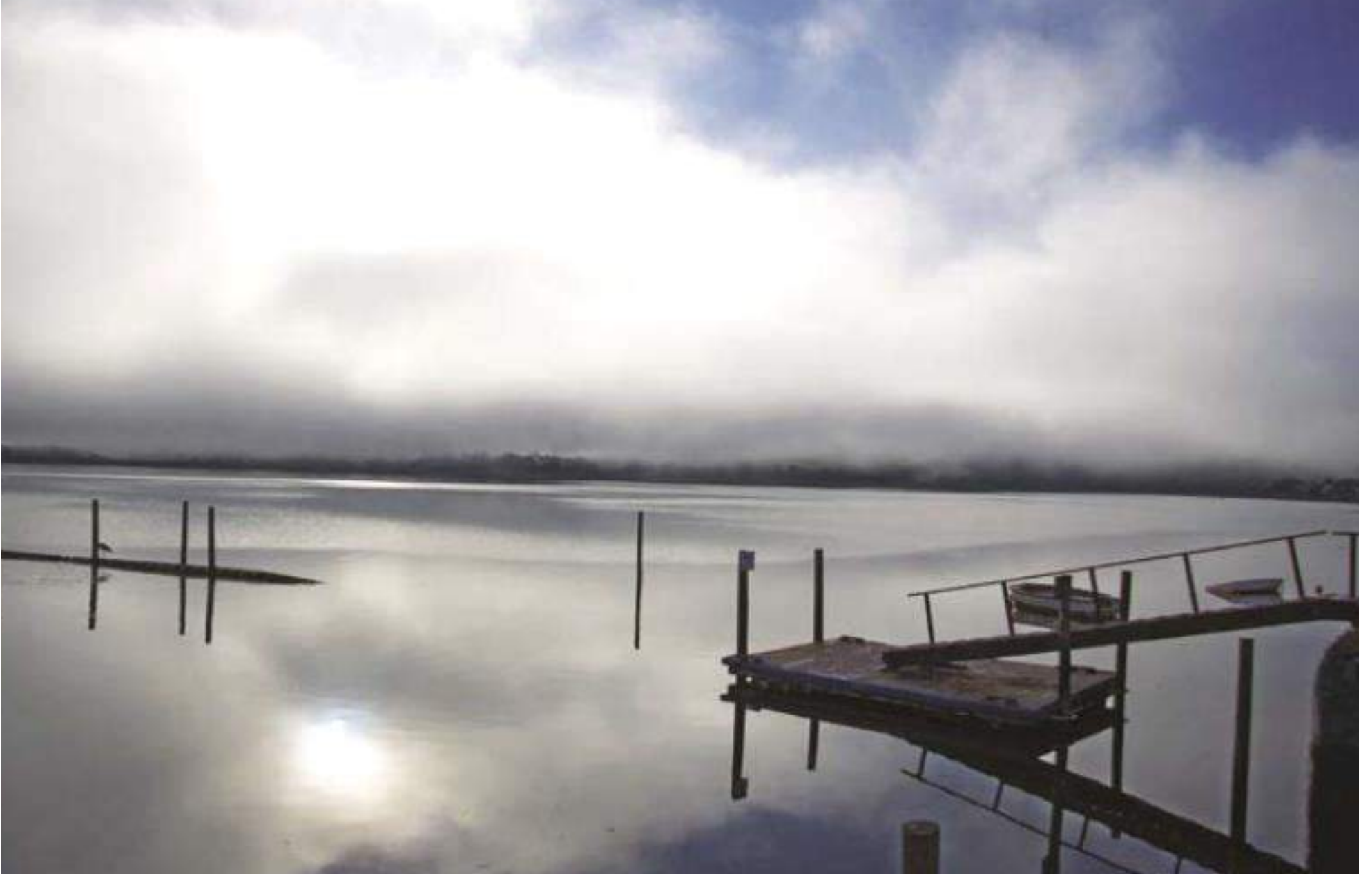
Misty morning at Leisure Isle,