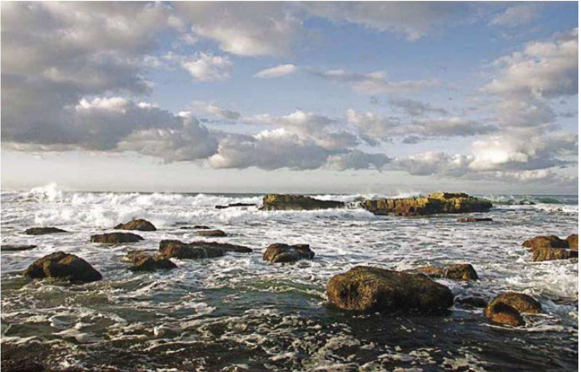
Wild Coast waves.