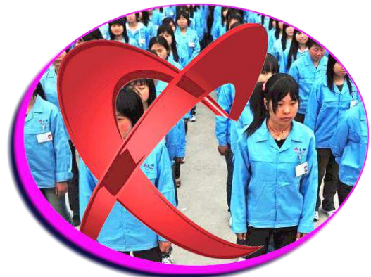
Increased global competition