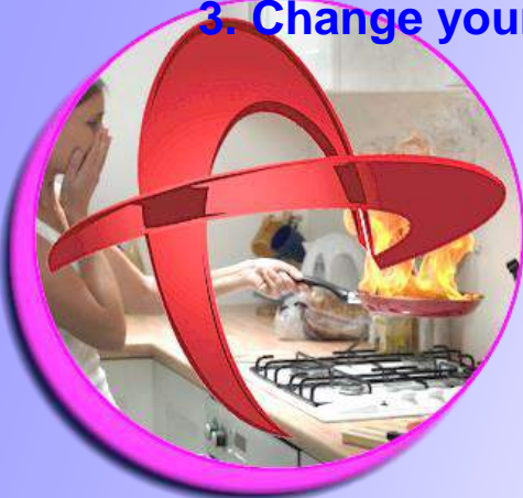
From a home maker